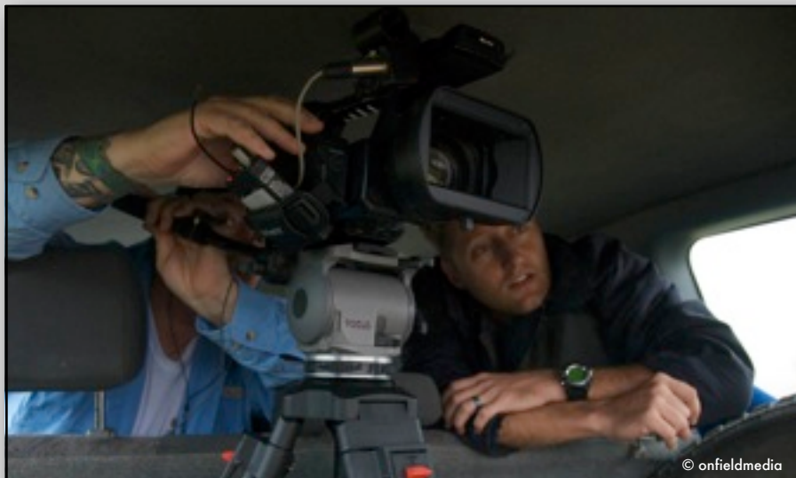
Shooting during a rain storm from the shelter in the back of an SUV.