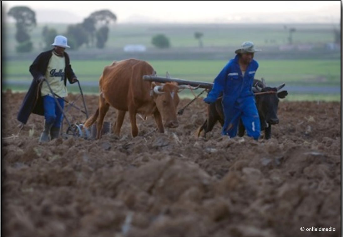
Farmers in Lesotho plant their corn hoping for a good harvest.